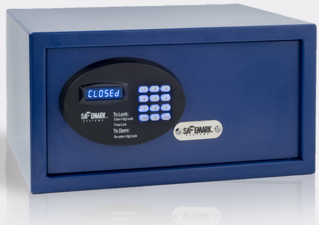
■ Formula Blue™ with Black Keypad and Blue Display